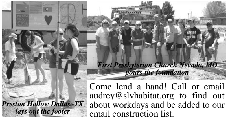
Preston Hollow Dallas, TX lays out the footer