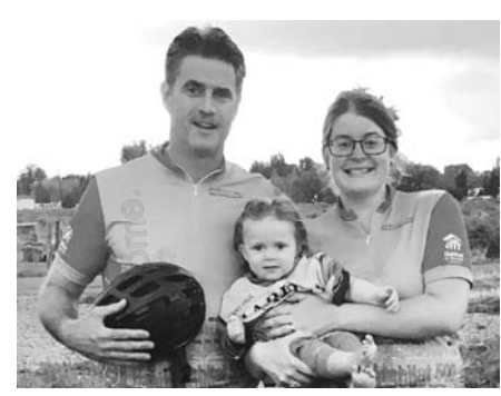
Building on a Foundation of Family