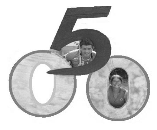
Donations can be mailed to SLV Habitat for Humanity PO Box 1197 Alamosa, CO 81101