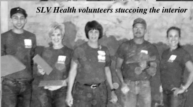
SLV Health volunteers stuccoing the interior