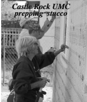
Castle Rock UMC prepping stucco